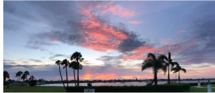
Sunrise over Our Lady of Florida Retreat Center, North Palm Beach

Few are they who by faith touch Him; multitudes are they who throng about Him. ~Augustine