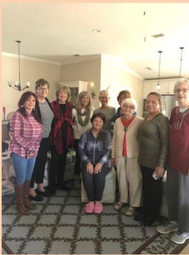
Tuesday Morning Centering Prayer Group at Santa Maria del Mar

On December 18, 2017, the members of the Tuesday morning Centering Prayer group at Santa Maria del Mar were blessed to share a Christmas celebration.