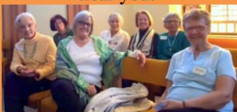
One 2017 Day of Prayer Group

We encourage you to consider having a United Day of Prayer with other Centering Prayer groups near you.