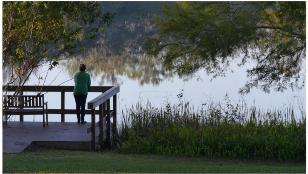
Canterbury Retreat Center, 1601 Alafaya Trail, Oviedo, Florida December 1-3, 2017

If so, please contact Sue at gottawrite@earthlink.net